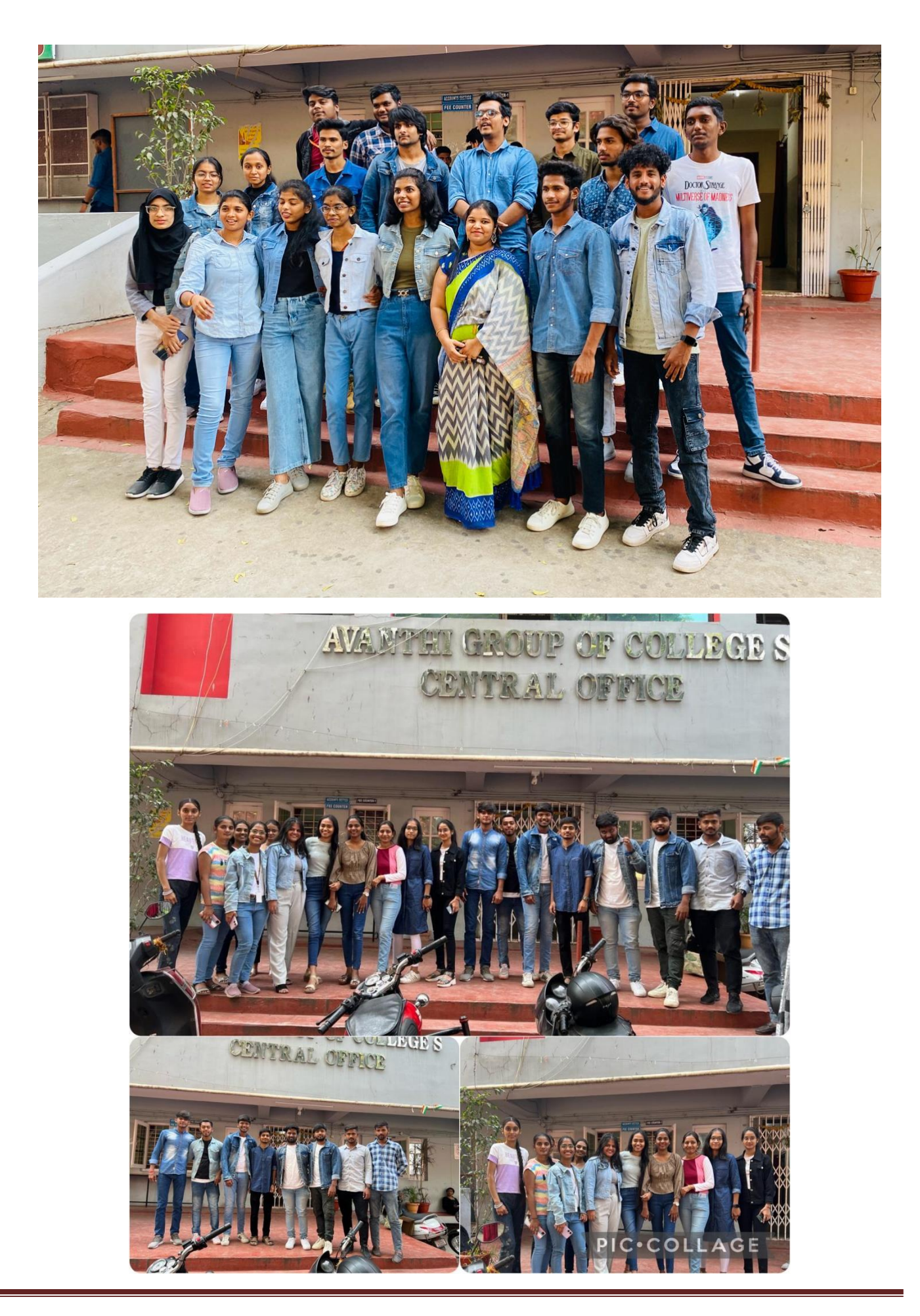
Committed to Excellence in Higher Education